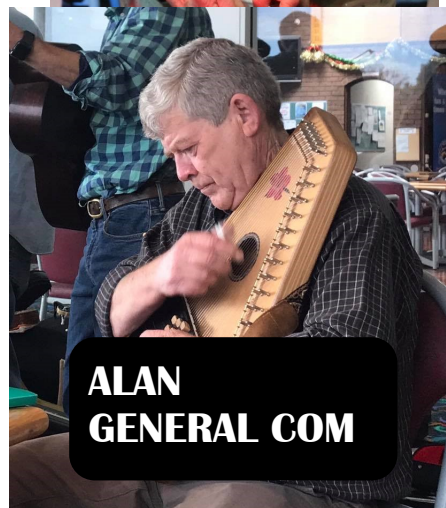
ALAN GENERAL COM