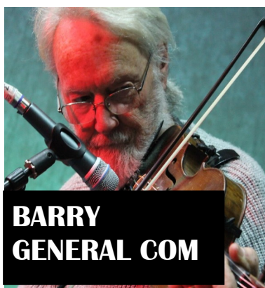
BARRY GENERAL COM